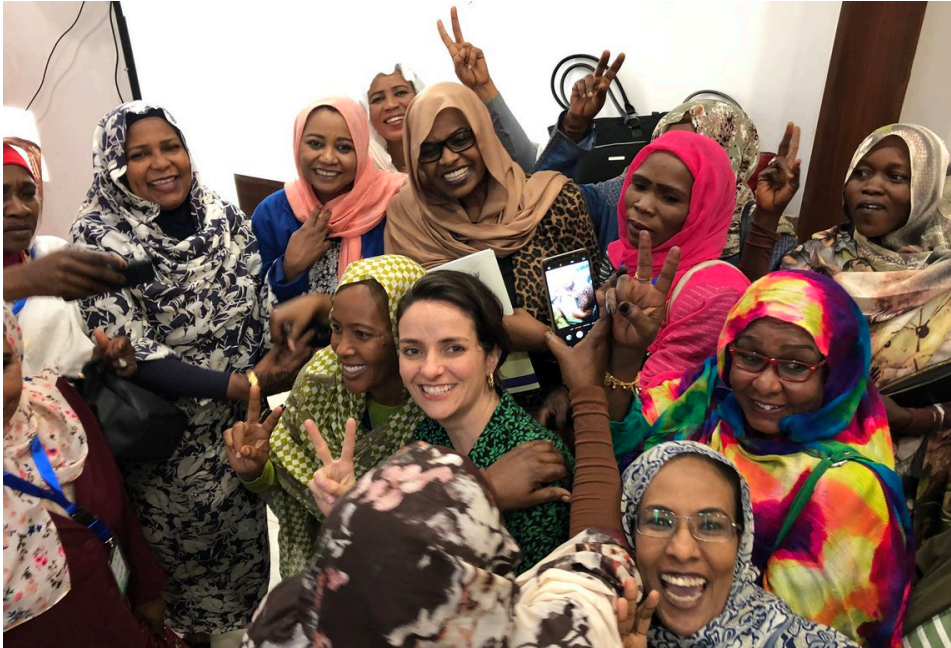
Ambassador O'Neill in Khartoum at a workshop on the drafting of Sudan's National Action Plan for Women, Peace and Security in December 2019.